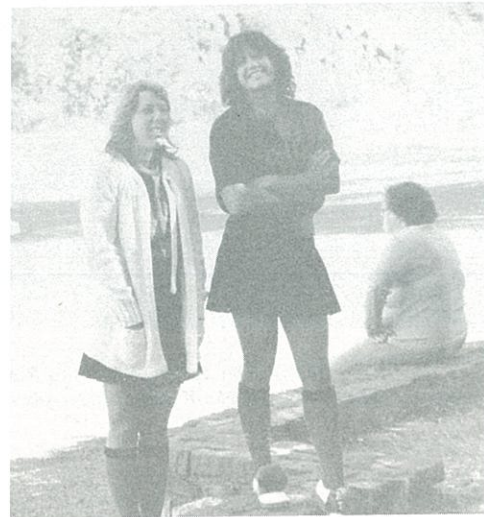
Our Group had 59% fewer cavities. SEE?