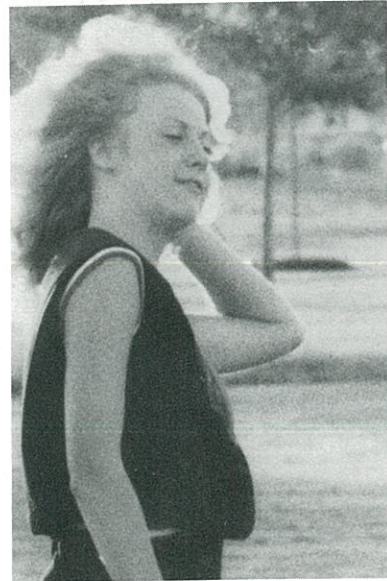
I just washed my hair and I can't do a thing with it.