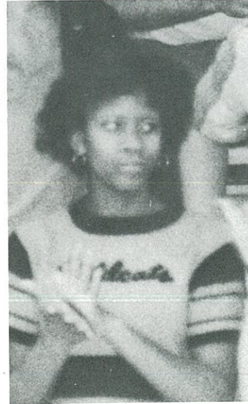
If eyes could kill . . . . .